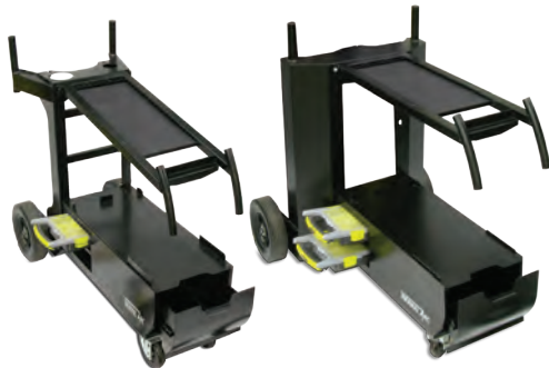
Single Cylinder Cart